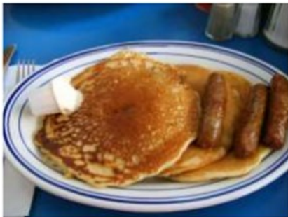
Sugar Bush Pancake Breakfast March 26 9:00a-1:00p

Work at camp this summer! - shetek.org/work-at-shetek