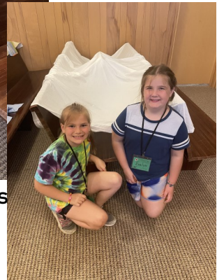
Bible Story: Moses in the Wilderness Hands-On Activity: Tent Building