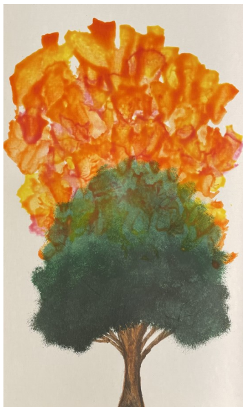
Bible Story: The Burning Bush Hands-On Activity: Breath Painting