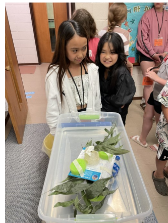
Bible Story: Peter Walks on Water Hands-On Activity: Boat Building