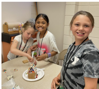
Bible Story: The Wise & Foolish Builders Hands-On Activity: House Building